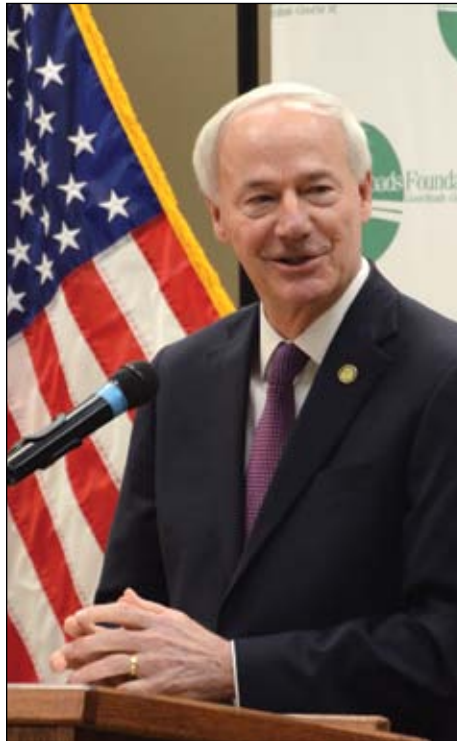
GOV. ASA HUTCHINSON tells the Arkansas Good Roads Foundation Sept. 23 that 69% of Arkansans supported Issue 1 in a recent poll. While encouraged by the numbers, he told his audience that he's "lost campaigns before," so "you push till the finish line."

"When I tell you those numbers, I'm gratified with them, but I've run campaigns before," he said. "I've lost campaigns before. I've won campaigns before, and you push till the finish line. And voters change their mind, there's going to be ads out there in opposition to it, so do not quit in terms of the messaging."