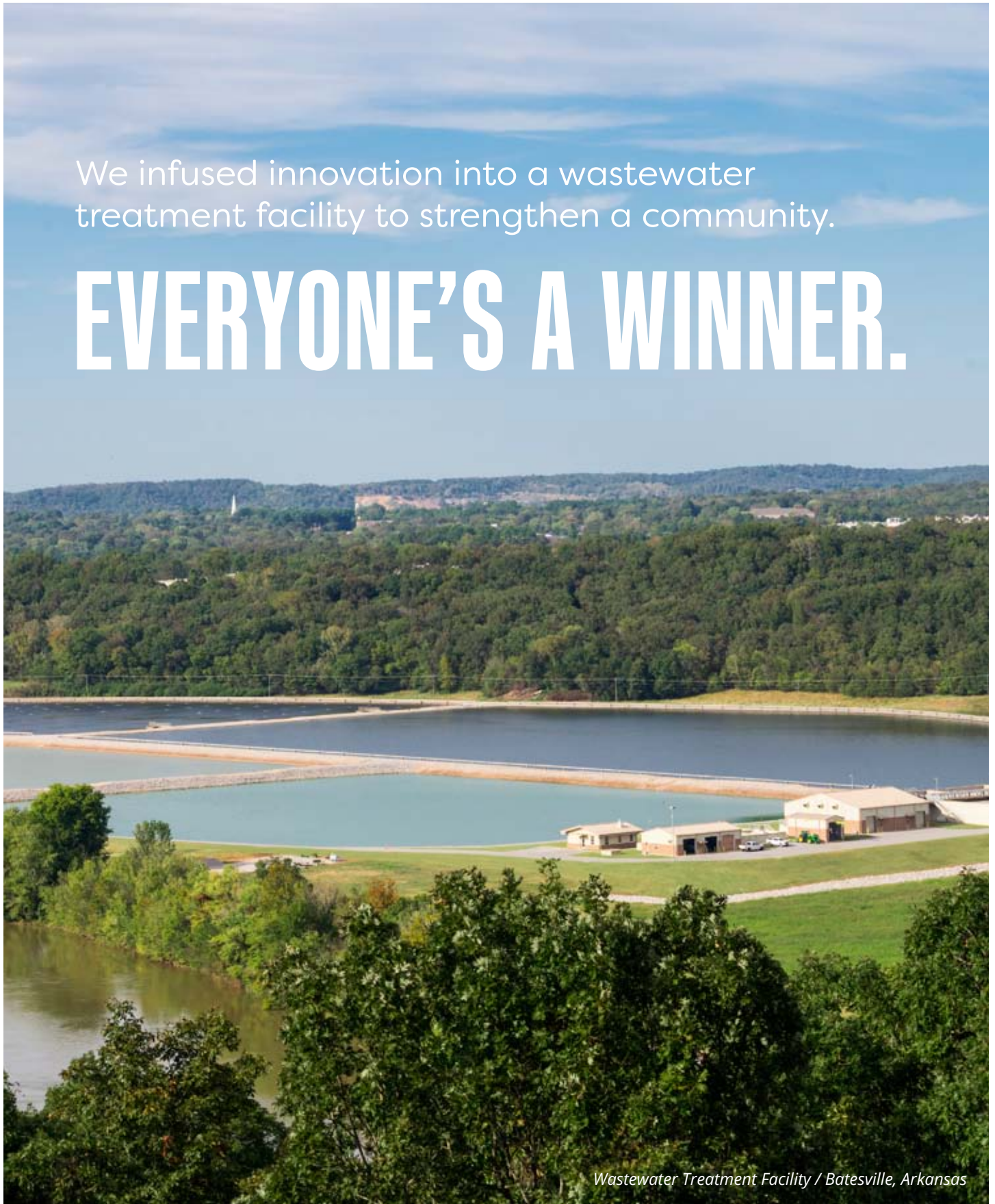
Wastewater Treatment Facility / Batesville, Arkansas