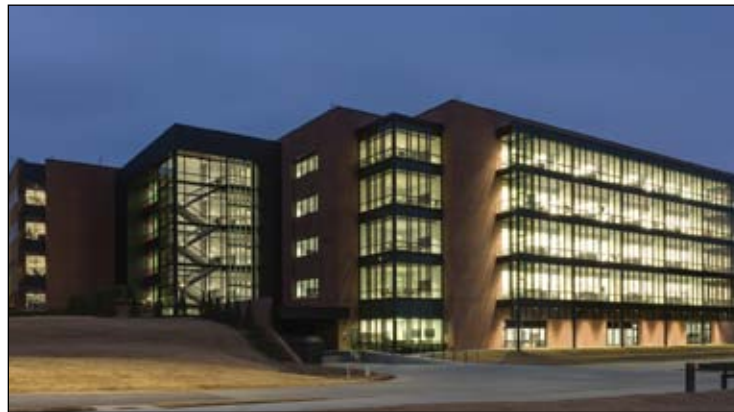
HSA ENGINEERING has focused its efforts on K-12 public education while serving other types of clients. Above is the Bentonville West High School, which required 1,000-1,200 feet of piping for heating and air. At left is the J.B. Hunt Office Tower in Lowell.

particles from landing on surfaces, rather than cycling fans to save energy and reduce noise, as often occurs now.