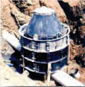
ICM Manhole Forms

ICM serving Contractors and Municipalities since 1970.