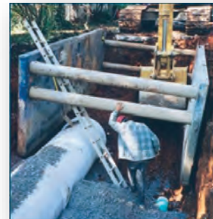
GME Trench Safety Shields

ICM's latest concentration of service is solving our manhole problem and other infrastructure deterioration. There are more than 20 million manholes in the United States and more than half were installed prior to 1960.