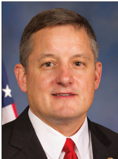
U.S. REP. BRUCE WESTERMAN, R-Ark., a professional engineer, says infrastructure could be a priority in Washington, but funding must be found.