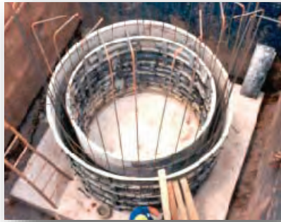
ICM Wetwell with GME Pit Box