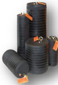
Cherne Pipe Plugs