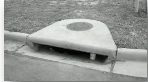
ICM Round Drop Inlets