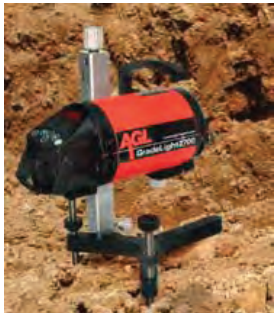
AGL Pipe Lasers