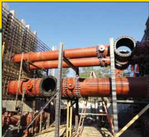
Filter Gallery Piping Clarksville Light & Water Company

You didn't go to engineering school to play politics. You went to engineering school to learn to build things. However, the most important thing engineers can build is relationships, particularly with the people that matter. Construct those first, and the rest will follow.