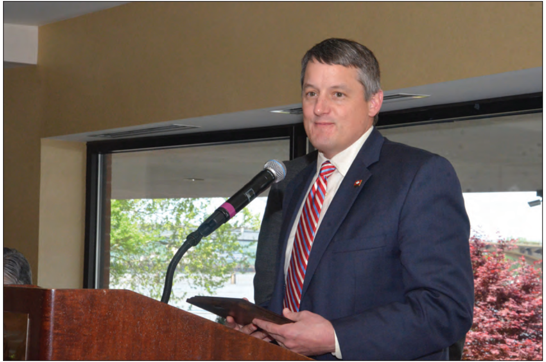
REP. BRUCE WESTERMAN accepts his award as ASPE Engineer of the Year at the Annual State Conference in April.

Despite being the leader of the Republican caucus, Westerman didn't get everything he wanted. His bill that would have tied the growth of state government to the rate of increase of the state's gross domestic product didn't pass. He also opposed the private option, which did pass. After studying the issue carefully and being involved in many of the discussions with Gov. Mike Beebe's administration about it, he decided that the federal government wasn't willing to give the state enough flexibility.