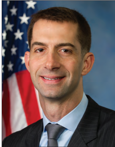
by Rep. Tom Cotton

As a solution, President Obama and other Washington liberals have proposed a national "infrastructure bank" to fund projects. But this proposal falls short and fails to account for the exploding costs, delays, and bureaucracy that are now