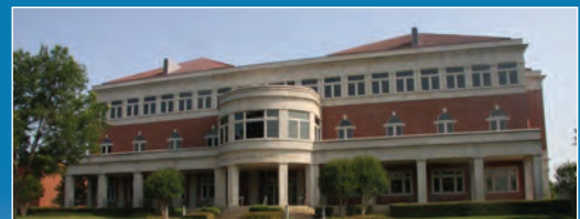
Ross Pendergraft Library, Arkansas Tech University